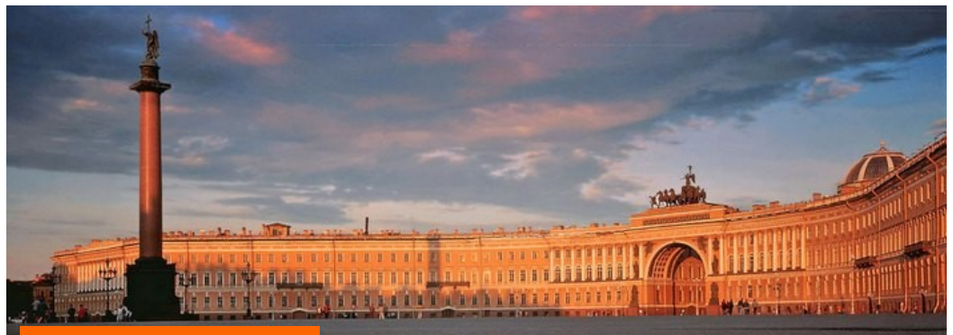
Pre-PIM Meeting 2012